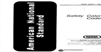
Ansi z535.1 safety color code pdf. Ansi z535.1 safety color code standard. Ansi z535.1 safety color code.